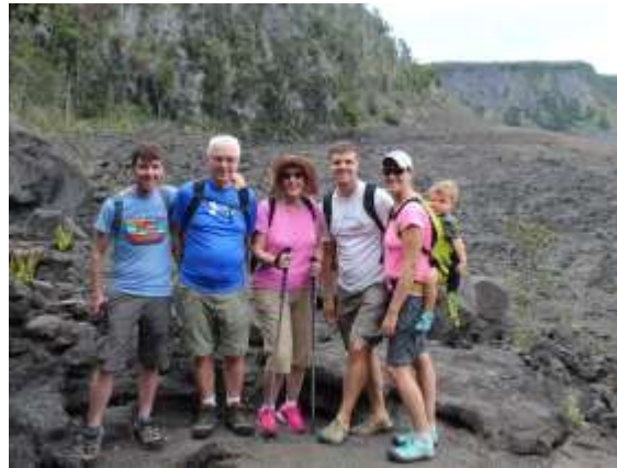
Hiking in the Kilauea Iki Crater