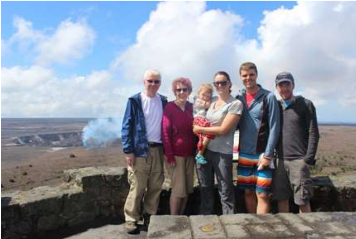
Our family at the Halema'uma'u Volcano Crater – Hawaii Volcanoes National Park - May 2014

Happy, Happy Holidays 2014 to all our friends and family!