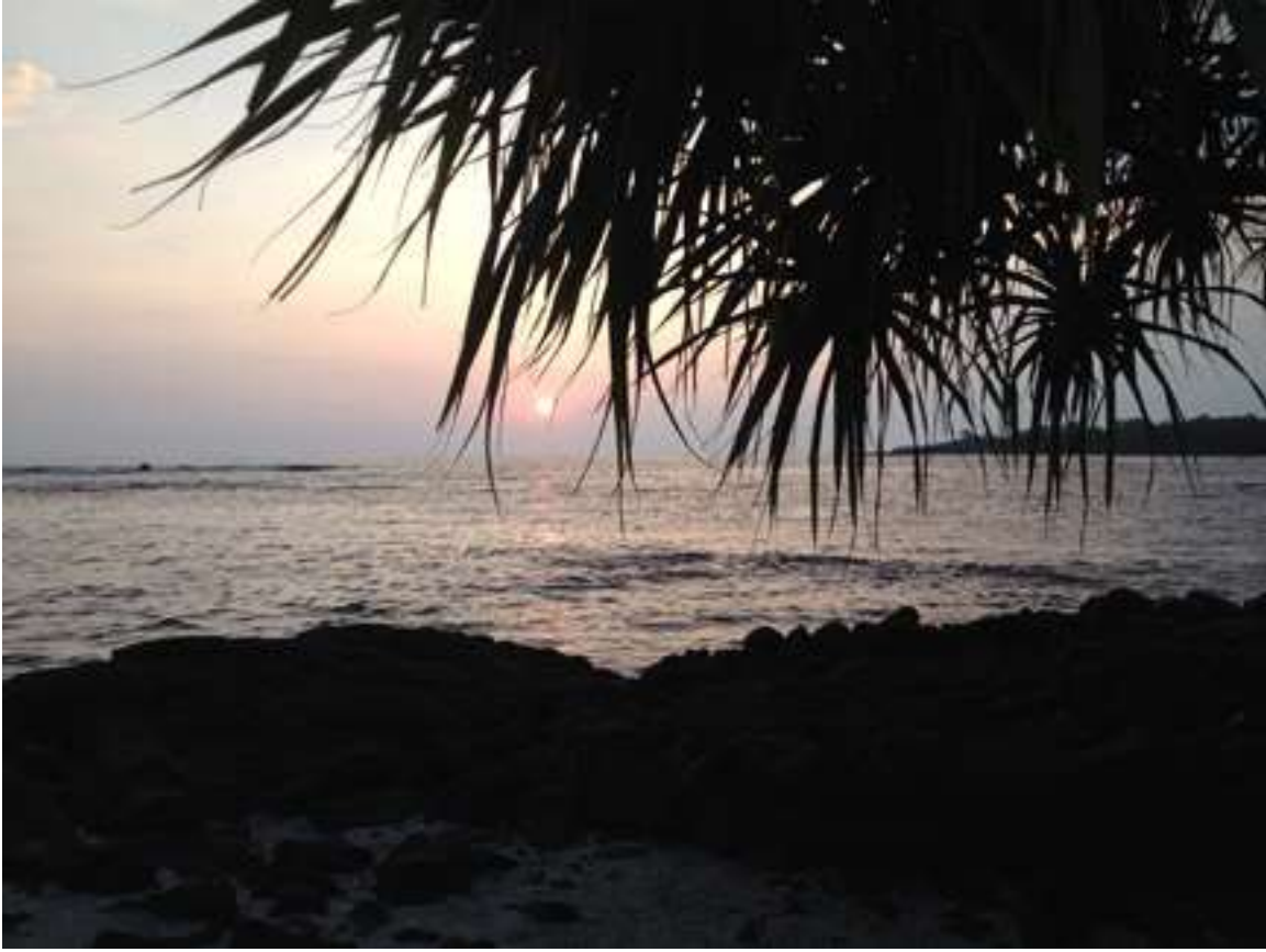
Beautiful sunset on the Big Island in Hawaii – Aloha!