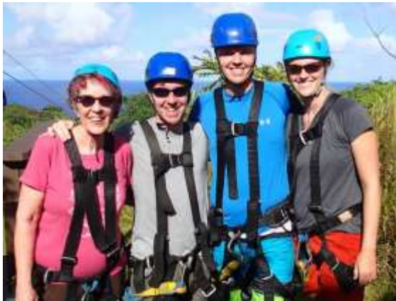
A rest between Zip Lines on the Big Island