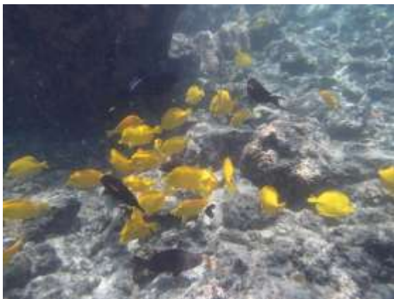
Snorkeling near the Captain Cook Monument- The protected Green Sea Turtles of Hawaii